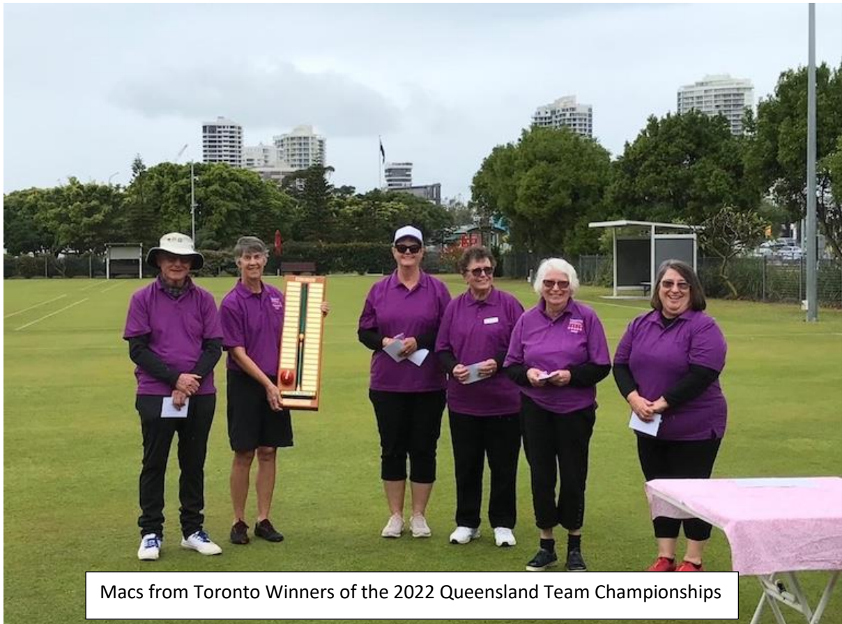
Macs from Toronto Winners of the 2022 Queensland Team Championships

With support from the ACA, our coaching numbers have increased with sixteen Level 1, nine Level 2 and 2 Level 3 coaches now accredited.