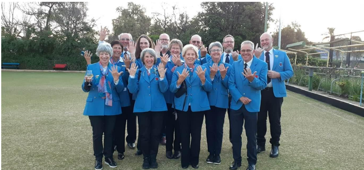
NSW Interstate Team players. Looking very happy with themselves and resplendent in their NSW blazers.