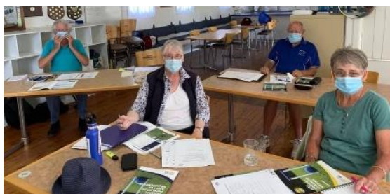
Scenes from Coaching Accreditation Courses at Port Macquarie, Strathfield and Tempe in 2021/22