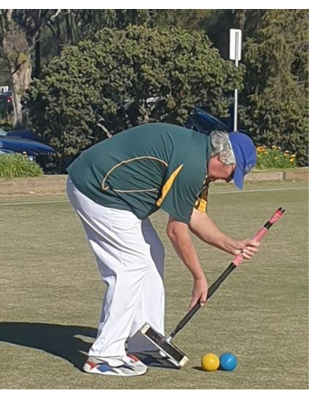
2JOHN STOKES PHOTOGRAPHER PLAYING IN THE BERYL CHAMBERS