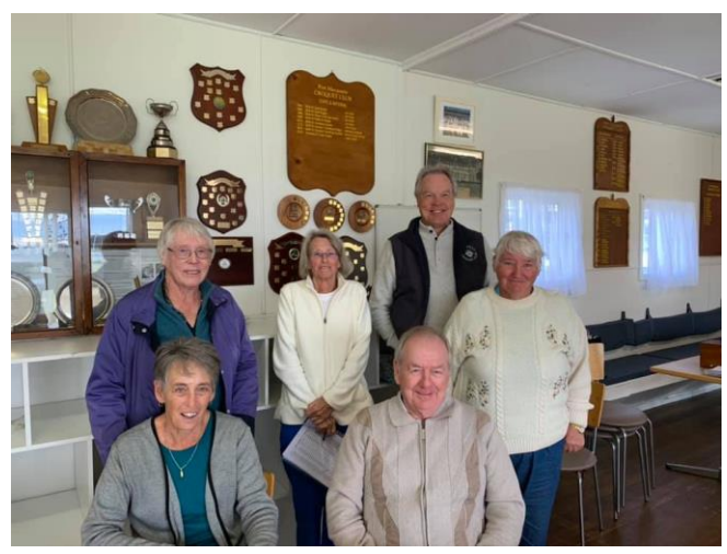
3REFEREES FROM MID NORTH COAST AND COFFS COAST FOLLOWING REACCREDITATION

Rules Books can be purchased via the Merchandising Officer.