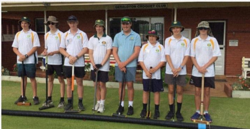
Players in the last Under 21 GC Championship at Geraldton in 2020.

The fifth Australian Under 21 Golf Croquet Championship is a unique opportunity to hone skills against players of similar age and experience. The location of this event, being held at Eildon Croquet Club, Woody Point in Redcliffe, Queensland during the summer holidays, perfect for exploring Queensland's famous tourist attractions. Limited billets are available for competitors and their parents.