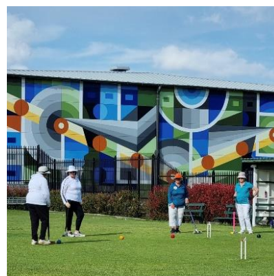
Hurstville has the best backdrop!