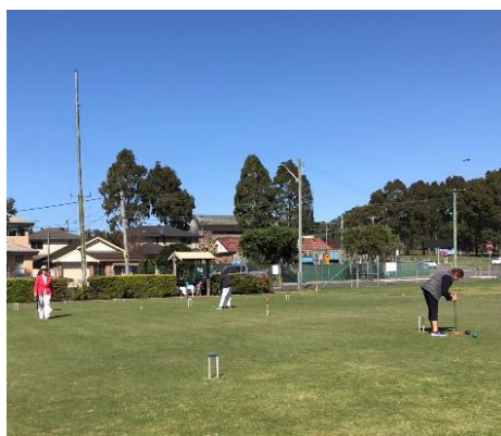
Holroyd (at home) vs Coogee

The Golf Croquet teams event was designed to encourage maximum participation and promote newer player development. Teams of 4 played a round robin of tests of 10 games, 2 double and 4 singles. At the beginning of a test, the combined handicaps for the 4 players in the team had to be at least 28 with players ranked to determine game allocation. Given the number of teams entering, 2 blocks were needed. There were 3 teams from both Coogee and Marrickville, 2 from CRCC and 1 from each of the other Makara club,s meaning well over 60 players participated across the season. The handicap caps meant there was participation of players at all levels with many in their first ever tournament. Special mention here goes to Holroyd with most of their player first timers with great attitudes! Overall winners were Sutherland (K block) and CRCC (M block), Coogee Shells and Coogee Mermaids runners up respectively.