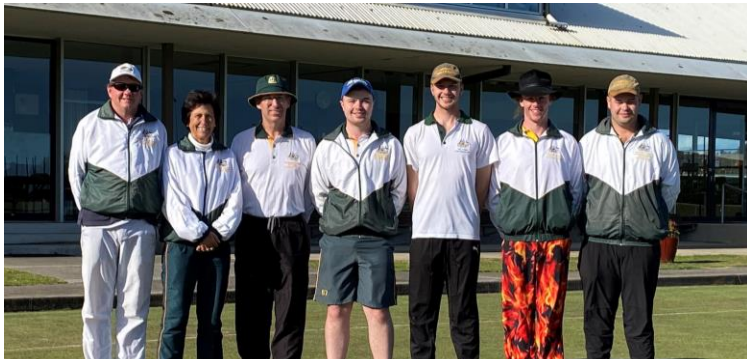
The Australian Team (L:R)