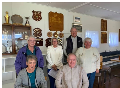
3 AC referees from Mid north coast and Coffs Coast following re-accreditation

This year saw the introduction of the 7 th Edition of the Laws of Association Croquet and the ensuing re-accreditation of referees and umpires. 25 AC referees and 10 umpires have been re-accredited; Rule Books have been distributed to Referees and Umpires and are now available for Club purchase. Referee training has been active along the mid north Coast and Coffs coast.