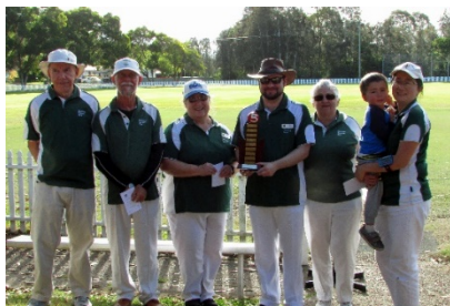
Canberra Mavericks – winner of the 2021 NSW State Teams Championships

Due to Covid restrictions NSW Gateball was able to hold only one major tournament. Fortunately,