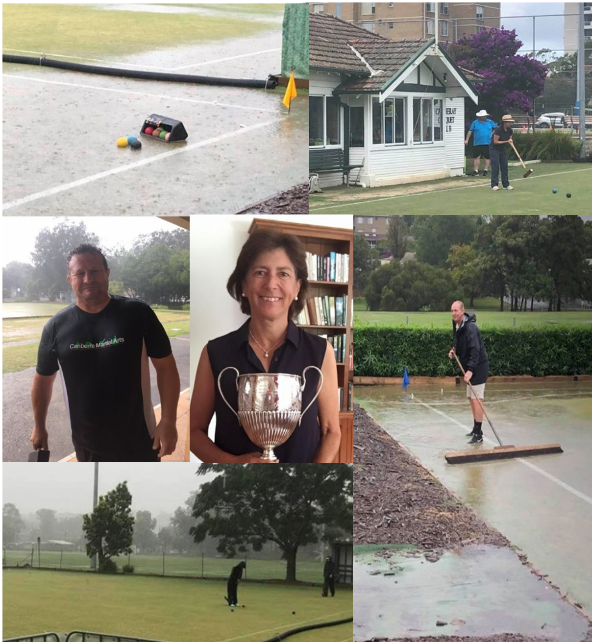
1Scenes from the Eastern Seaboard AC competition in March