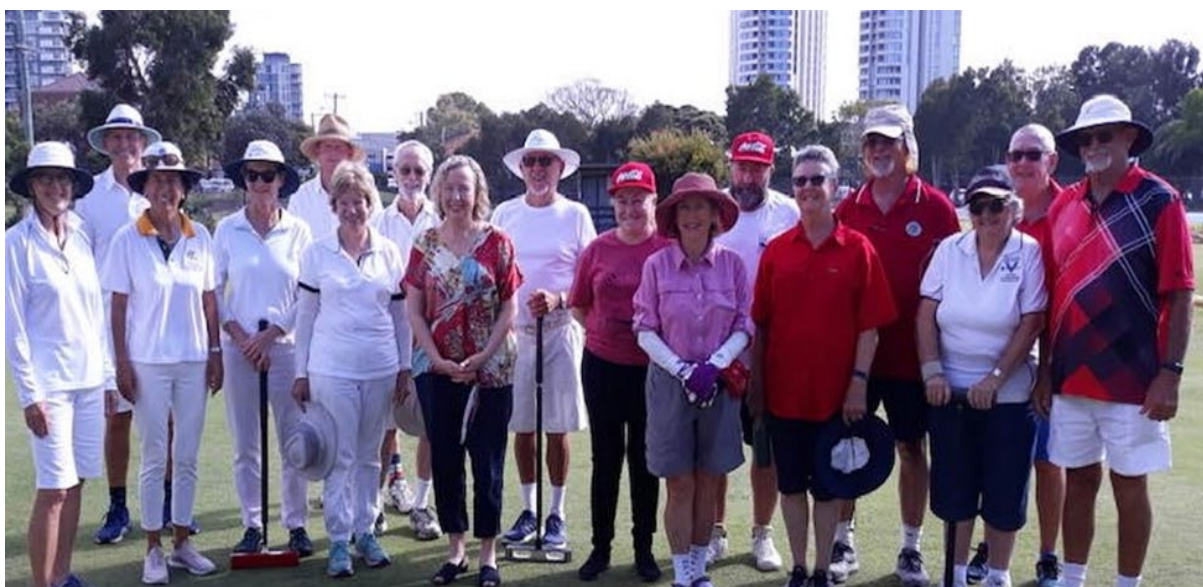
NSW Intrastate Cup players. With the cancellation of the Interstate Golf Croquet Shield competition in 2020, squad members were divided into two teams: Red and White and played a 2 day contest, kindly hosted at Newcastle Croquet Club, December 5 & 6. Both teams were victorious on one of the days. Well done all, and thanks to Newcastle for hosting.