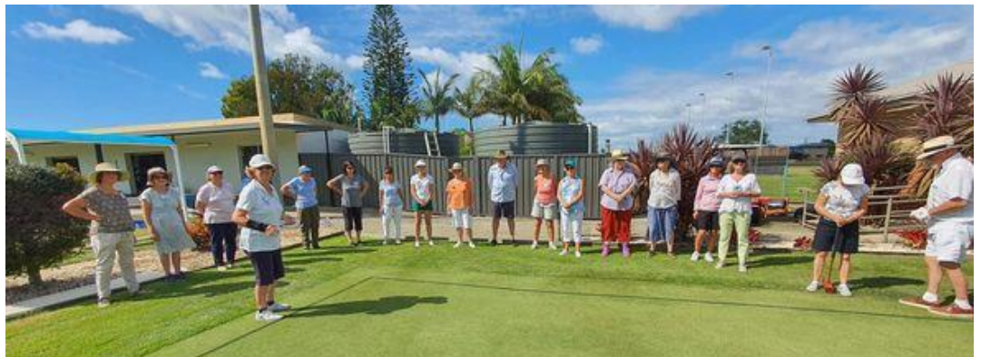
Coaching at Ballina Croquet Club for U3A